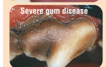
Progression of gum disease