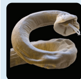
Electron micrograph of an adult lungworm (You won't see them as they live in the lungs!)