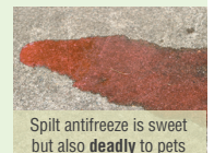
Spilt antifreeze is sweet but also deadly to pets

Around the house and garden, keep a wary eye out for toxins at this time of year. Pets are very attracted to ethylene glycol (antifreeze) , which is easily spilt when topping up radiators. It is very sweet tasting and extremely toxic to pets, causing kidney failure and often death. In the garden, try to ensure pets don't eat fermenting apples and also conkers – both of which can lead to digestive upsets.