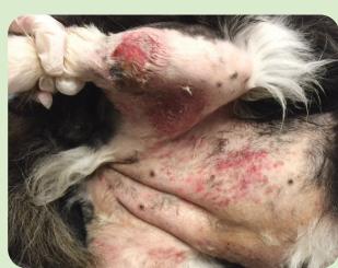
Typical photo of a suspected case of Alabama Rot with skin lesions

Fortunately, it is still very rare and additionally, most skin lesions will not be related to Alabama Rot; however, if you notice any unusual skin patterns on your dog's skin and need any advice please contact us straight away at the surgery.