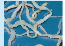
Tapeworms are long segmented worms which shed segments.

Tapeworms live in the intestines and shed small mobile segments that pass out in the faeces and are often found around the tail areas of cats. As the segments break down, they release eggs into the environment. These eggs may be eaten by intermediate hosts – these include fleas and small rodents such as mice and voles. As a result, tapeworms can be acquired via food (cats eating small rodents) or via swallowing an infected flea during grooming. Pets with tapeworms may not show any obvious clinical signs, meaning that they can be carried silently. Some animals will show failure to thrive, malaise and diarrhoea.