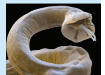
Electron-micrograph of an adult A. vasorum.

In cats, they become infected in a similar way or even if they eat infected prey. Cats may show coughing, breathing difficulties, weight loss and poor appetite. With all lungworms, due to the severity of signs shown, this can make pets really unwell.