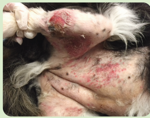
Typical photo of a suspected case of Alabama Rot with skin lesions

Alabama Rot is a disease that has been hitting the headlines recently. It has gained attention because it is hard to diagnose but is often fatal. However, it is important to remember that it is also very rare.