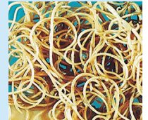
Roundworms are long, white and spaghetti like.

Adult roundworms shed eggs which are passed out in your pet's faeces and infect the environment. The eggs become infective within a few weeks and pets can become re-infected by unwittingly eating the eggs, often whilst grooming. Additionally the eggs can pose a risk to humans if accidentally ingested.