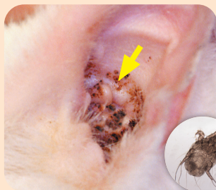
Opening to the vertical ear canal in a cat with a crusty brown discharge typical of ear mites Otodectes cynotis (inset)