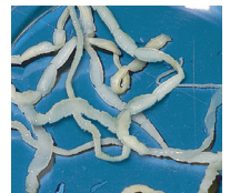
Tapeworms are long segmented worms which shed segments.

Tapeworms are long flat, segmented worms which live in the small intestines. They shed small mobile segments that pass out in the faeces and are often found around the tail areas of cats. As the segments break down they release eggs into the environment. These eggs may be eaten by intermediate hosts – these include fleas and small rodents such as mice and voles. As a result cats which are "mousers" will commonly have tapeworms. Similarly pets swallow fleas as they groom, and so re-infect themselves with tapeworms.