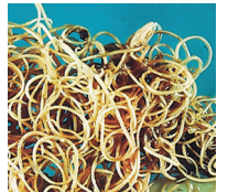
Roundworms are long, white and spaghetti like.

Roundworms are most commonly found in young animals but can infect adults as well. Many pups and kittens are born infected with roundworms because they cross the placenta and are also in the milk. They are spaghetti like in appearance and also live in the small intestines. They can cause weight loss, vomiting, diarrhoea and a pot belly in puppies and kittens. Adult roundworms shed eggs which are passed out in your pet's faeces and infect the environment. Pets can become re-infected by unwittingly eating the eggs, often whilst grooming. Additionally the eggs can pose a risk to humans if accidentally ingested.